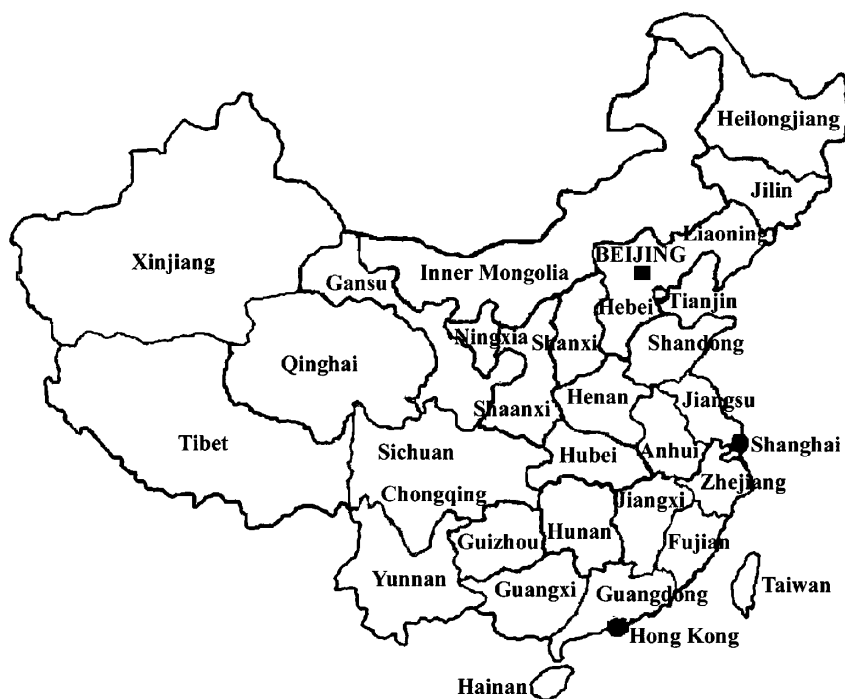
Fig. 1 Locations of each province in China